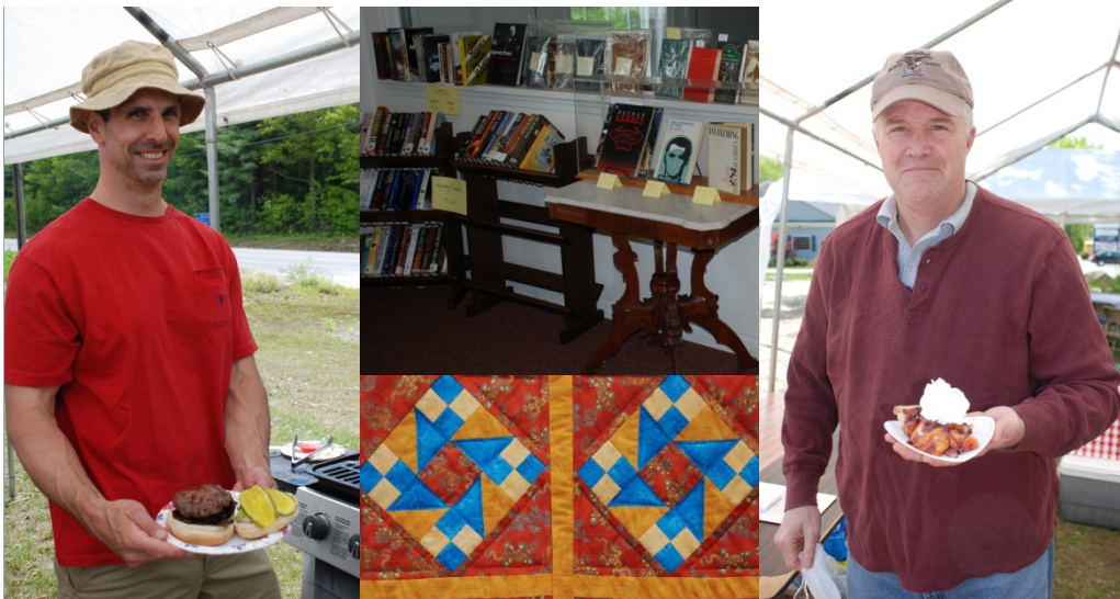
Hand-formed patties grilled to order and homemade fruit pies almost sold out at the May Fair, while attendees browsed for local crafts and used books.

An ELCA Congregation in the Heart of the Monadnock Region ■ Late Summer 2014 Issue